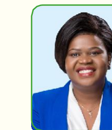
H.E. Gladys Wanga Homa Bay County