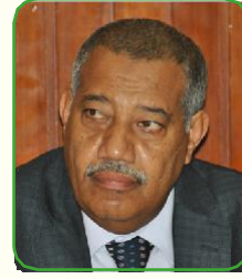
H.E. Issa Timamy Lamu County