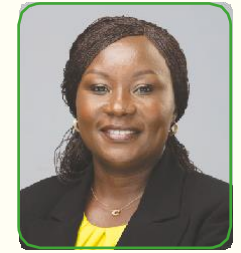
H.E. Cecily Mbarire Embu County