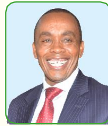
H.E. Kimani Wamatangi Kiambu County