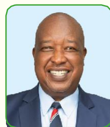
H.E. Amos Nyaribo Nyamira County