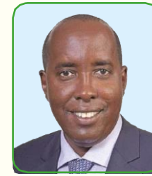
H.E. Joseph Ole Lenku Kajiado County