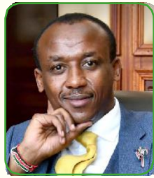
H.E. Mutula Kilonzo Jr Makueni County