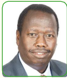
H.E. Benjamin Cheboi Baringo County