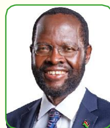
H.E. Prof Anyang' Nyong'o Kisumu County