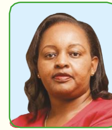
H.E. Anne Waiguru Kirinyaga County