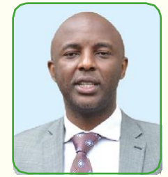
H.E. Irungu Kang'ata Murang'a County